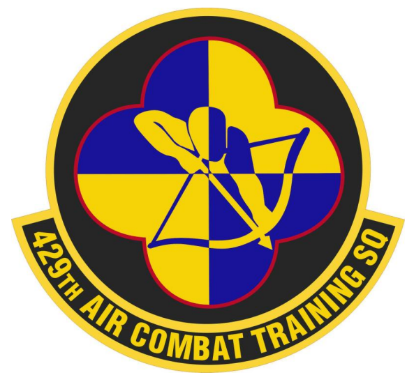
429 Air Combat Training Squadron emblem: on a disc Sable, a quatrefoil quartered Azure and Or, fimbriated Gules, charged with the head and arms of an archer firing an arrow to sinister base counterchanged of the field, all within a narrow border Yellow. Attached below the disc, a Black scroll edged with a narrow Yellow border and inscribed "429 AIR COMBAT TRAINING SQ" in Yellow letters. SIGNFICANCE: Ultramarine blue and Air Force yellow are the Air Force colors. Blue alludes to the sky, the primary theater of Air Force operations. Yellow refers to the sun and the excellence required of Air Force personnel. The background represents the night sky which is symbolic of night operations or operations that are hard to detect, a hallmark of remotely piloted aircraft units. The quatrefoil is a reference to the World War II emblem of the 429 Bombardment Squadron to which the unit traces its heritage. The alternating colors within the quatrefoil represent the multi-spectral polarities with which the unit can find their targets and also form a centered target reticle representing the precision and accuracy inherent in the weapon. The warrior with the drawn bow and arrow speaks to how the unit is always at the ready. The warrior is perched on high, overlooking the battlefield, lethally ready to react at a moment's notice. This position also represents the lofty goal of the Squadron's training mission, to produce the most highly trained warriors possible, always ready to provide constant surveillance and precision strike capability throughout the world.